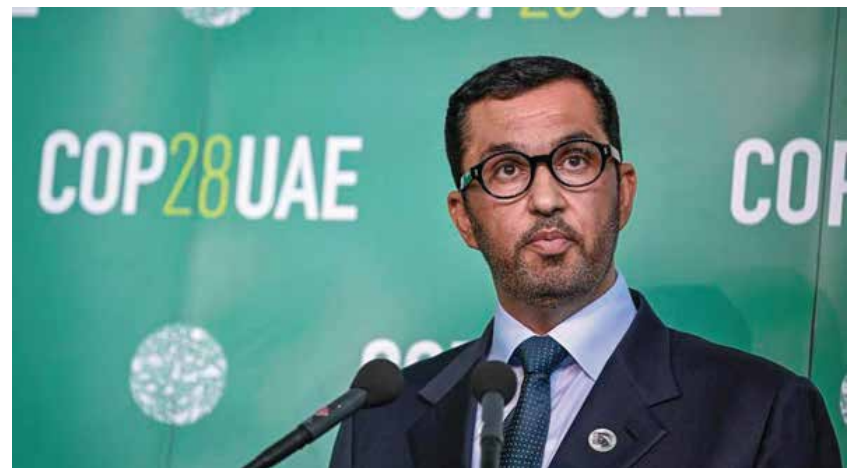
Controversial appointment: Sultan Ahmed al-Jaber speaks at a event at the Bonn Climate Change Conference in Bonn, Germany on June 8.

In July Mr. al-Jaber was also appointed Chairman of the Emirates Development Bank, which according to his Ministry's website, provides financial services for the sustainable economic and social development of the UAE.