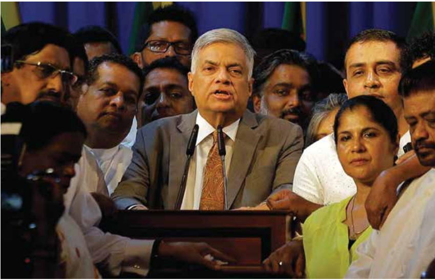
Pursuit of peace: Ranil Wickremesinghe speaking to his supporters in Colombo, Sri Lanka. File Photo

The island nation will achieve neither genuine reconciliation nor sustainable peace as long as impunity prevails, says Nada Al-Nashif, UN Deputy High Commissioner for Human Rights